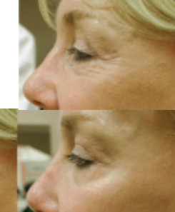
Madonna Eyelift